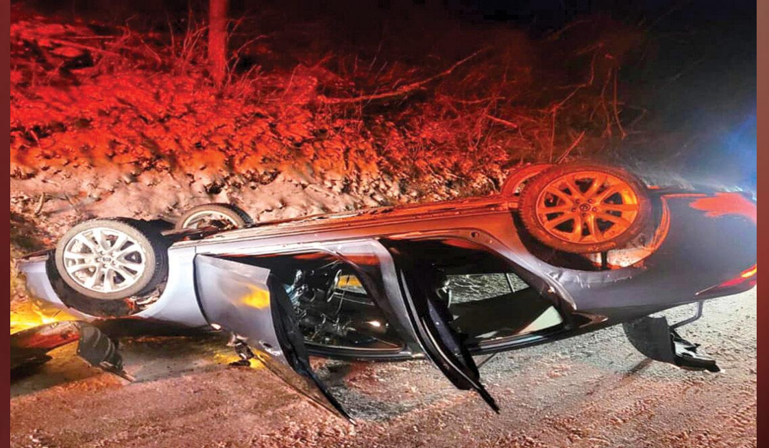
This vehicle came to rest on its top after colliding with a hillside and flipping over on the Whitmer Road in Randolph County. JAN 17, 2023 This is on Jerry Teter's Route bus 68-A.