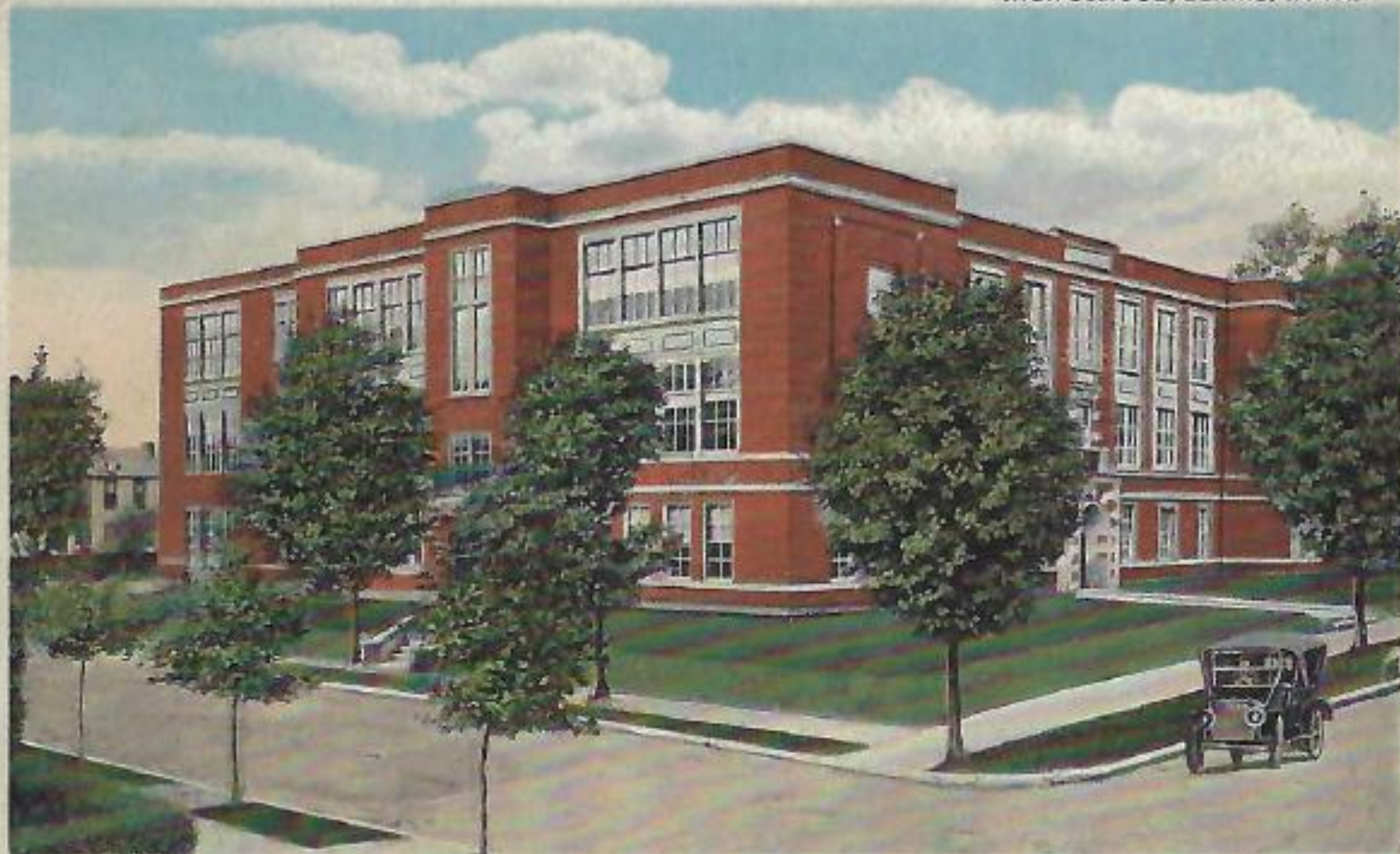
HIGH SCHOOL, ELKINS, W. VA.